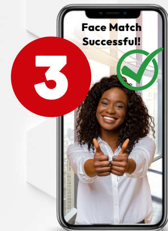
Validation + Sanction Screening