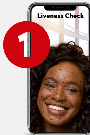
Selfie or live video stream